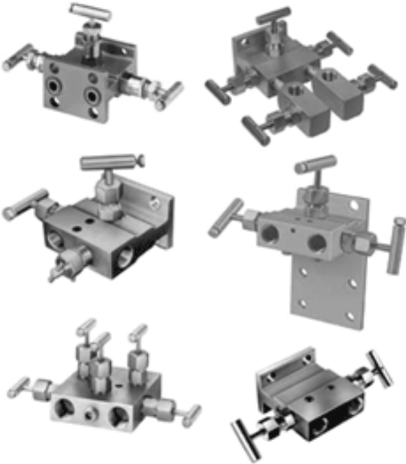
Manifolds, Syphon, Sun shade and etc.